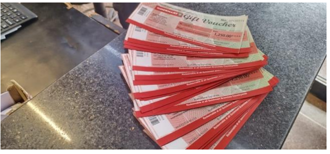
DECEMBER 2023, BEST MONTH OF THE YEAR

School holidays started last November, which meant the children were at home for 2 months. To keep them occupied, we prepared a rich calendar of activities to make sure our boys and girls are kept safe, healthy and stimulated.